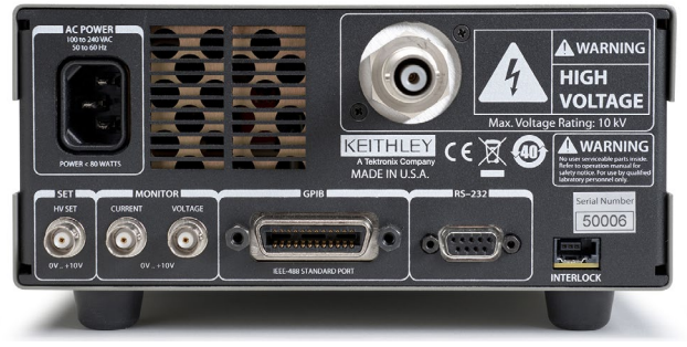
2290-10 rear panel showing the IEEE-488 interface connector, RS-232 interface connector, high voltage output connector, analog control/output connectors, and interlock connector.

The Series 2290's IEEE-488 interface allows the creation of an automated high voltage test system. Software drivers are supplied to simplify and accelerate test system development. This further enhances safety as the high voltage can be controlled from a remote location.