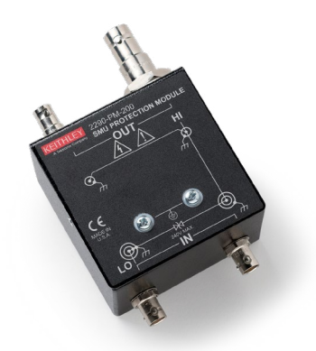
The 2290-PM-200 Protection Module protects low voltage measurement equipment from voltages greater than 200V.

Series 2290 Power Supplies and a 2290-PM-200 SMU Protection Module protect both user and instrumentation from hazardous voltages. An interlock circuit built into the power supplies can be used to ensure that the output voltage is disabled if a high voltage test fixture access door is open. In addition, all Series 2290 power supplies have low voltage analog outputs to permit safe monitoring of the high voltage and the output current.